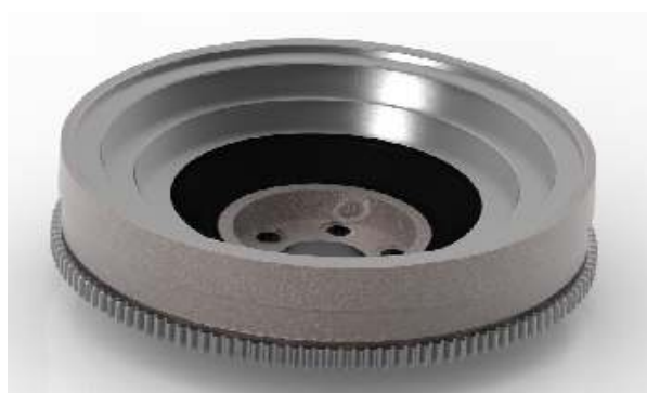
7-054032-700 – Flywheel assembly kit 7-054032-100 – Flywheel assembly

The MWM ring gear has been unavailable for approximately 2 years as a separate component. Replacement of the ring gear has required replacement of the flywheel 7-054032-700 assembly during this time.